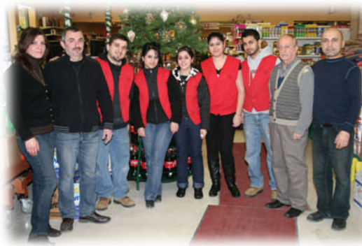
ORT students and Oakton Fresh Market staff come together for a photo. The staff appreciates the students' hard work transforming a dollar store into a full grocery store with more plans for expansion soon.

ORT's mission has always been to help our students reach employment and self-sufficiency – and it's playing out today in our own community.