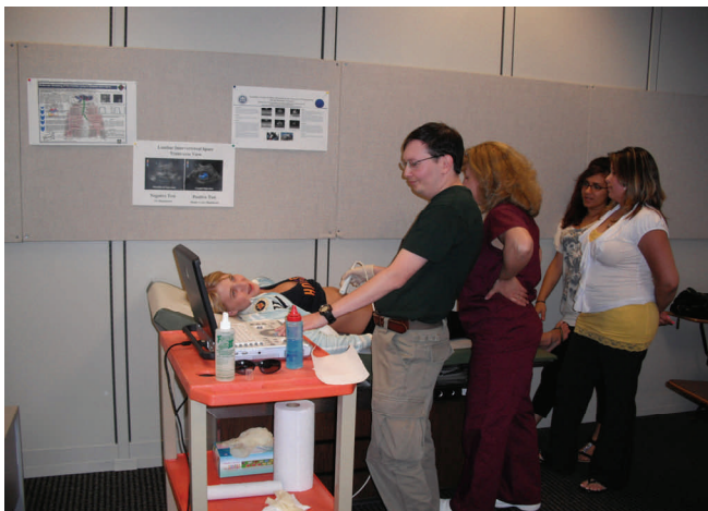
Medical Assistant students observe how to perform an ultrasound.

This mutually beneficial arrangement helps ORT students and local community members in need of an ultrasound.