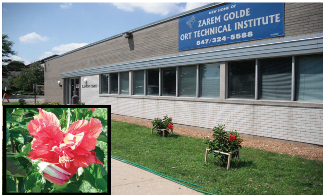
Large hibiscus flowers spread their red petals in front of ORT's entrance.

Anyone entering ORT's doors has noticed the beautiful flowers, manicured lawns, and trimmed trees at the front of the building.