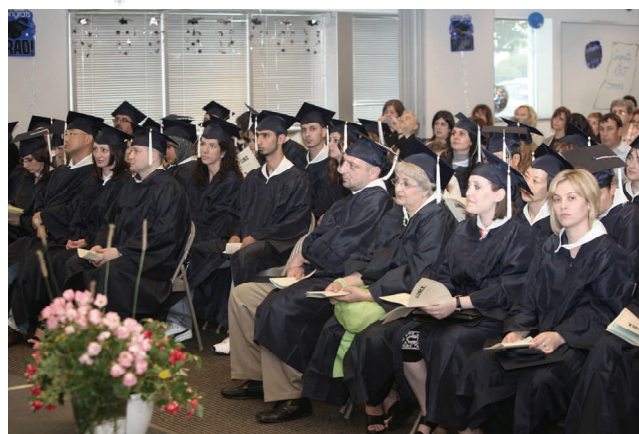
June 14, 2010 was an important day in the lives of ORT's newest graduates. They received their hard-earned certificates and left the ceremony with a sense of pride, accomplishment, and self-sufficiency.